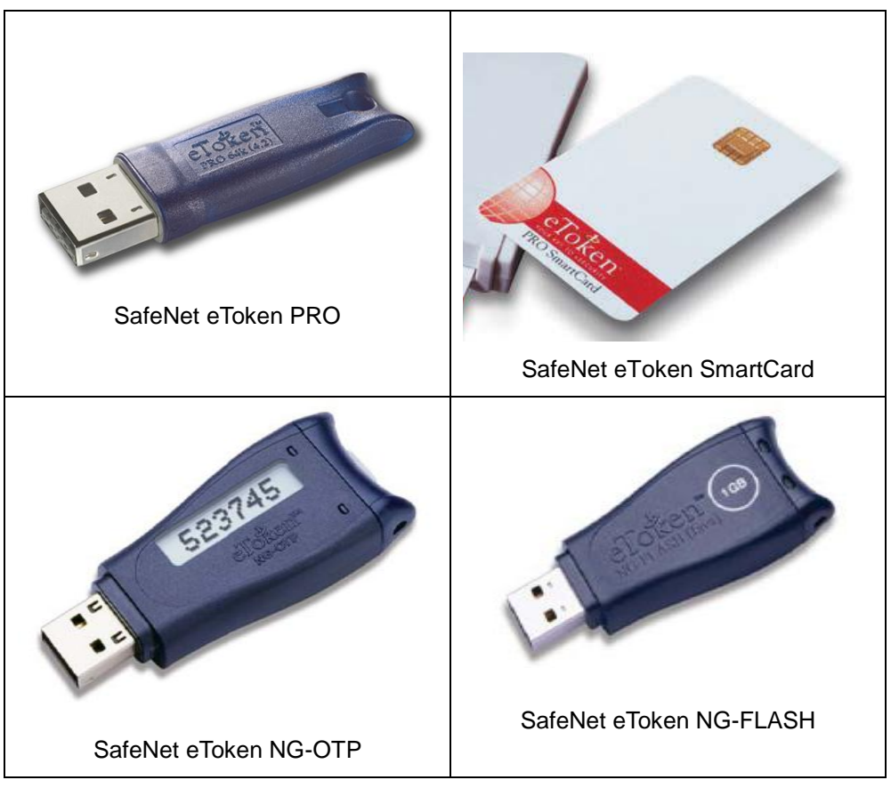
Figure 1 - TOE Form Factor

The TOE is a Smartcard IC in the form factor of a smartcard or a USB token where digital application software is masked in ROM.