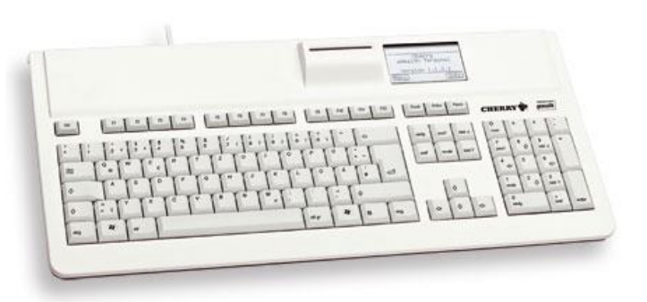
Figure 1: G87-1505

The G87-1505 does not provide a LAN- Interface for the communication with remote ITE. Separate software (Translating Proxy), which is not part of the TOE,