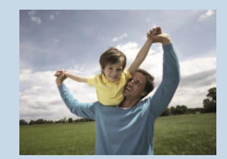
Published by Infineon Technologies AG