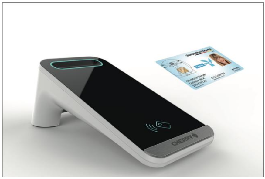
FIGURE 1.1: TOE

The Target of Evaluation (TOE) described in this Security Target is a smart card terminal which fulfils the requirements to be used with the German electronic Health Card (eHC) and the German Health Professional Card (HPC) based on the regulations of the German healthcare system. Please refer to see [gemSpec_KT] for further information about card compatibility. This terminal is based on the specification for a "Secure Interoperable Chip-Card terminal" ([SICCT]) extended and limited by the specifications for the e-Health terminal itself (see [gemSpec_KT]).