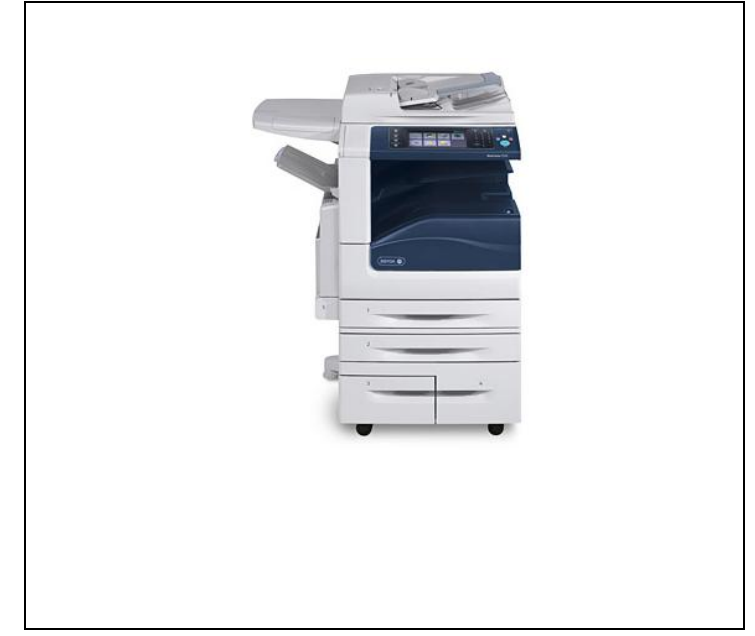
Figure 2: Xerox WorkCentre™ 7525/7530/7535/7545/7556

The hardware included in the TOE is shown in the figure below.