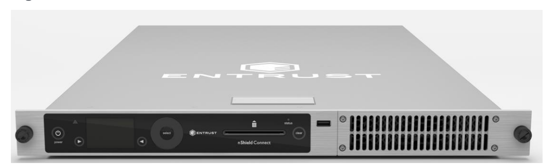
Figure 2 nShield Connect XC