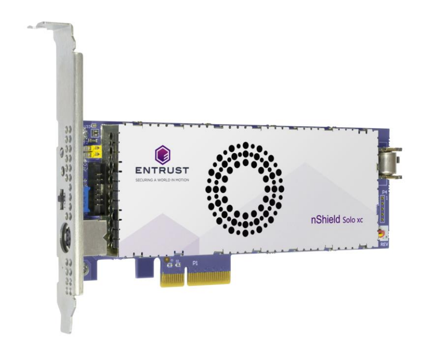
Figure 1 nShield XC HSM