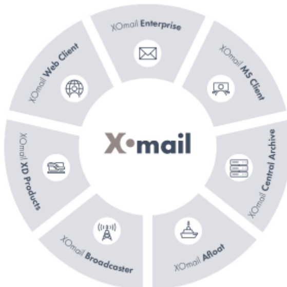
XOmail product family