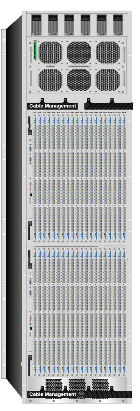
Prepared by Thinklogical