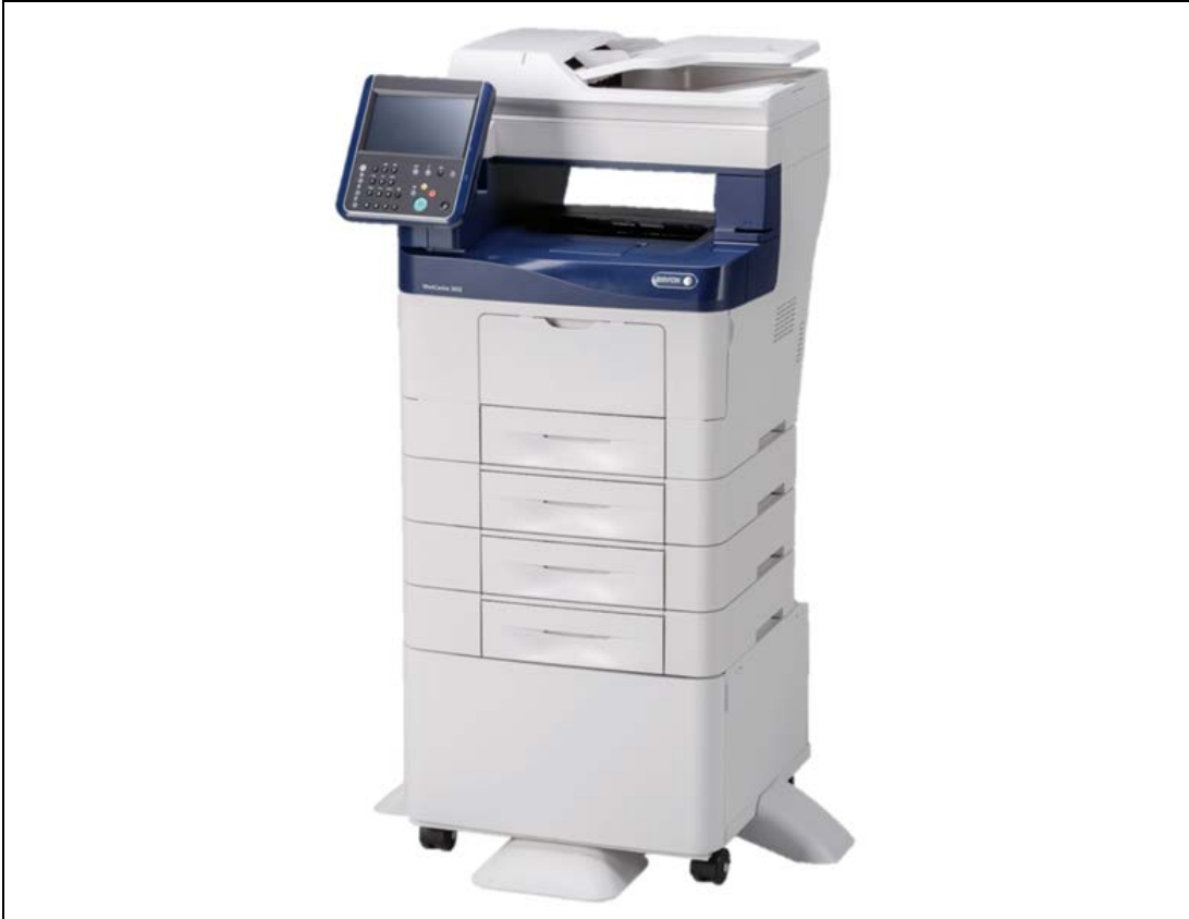
Figure 1: WorkCentre® 3655 Xerox® ConnectKey® Technology with SIPRNet Support

The TOE can integrate with an IPv4 network with native support for DHCP. The hardware included in the TOE is shown in the figure below.