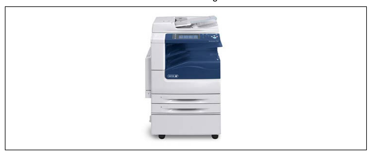
Figure 1: WorkCentre® 7220/7225 Xerox® ConnectKey® Technology with SIPRNet Support

The TOE can integrate with an IPv4 network with native support for DHCP. The hardware included in the TOE is shown in the figure below.