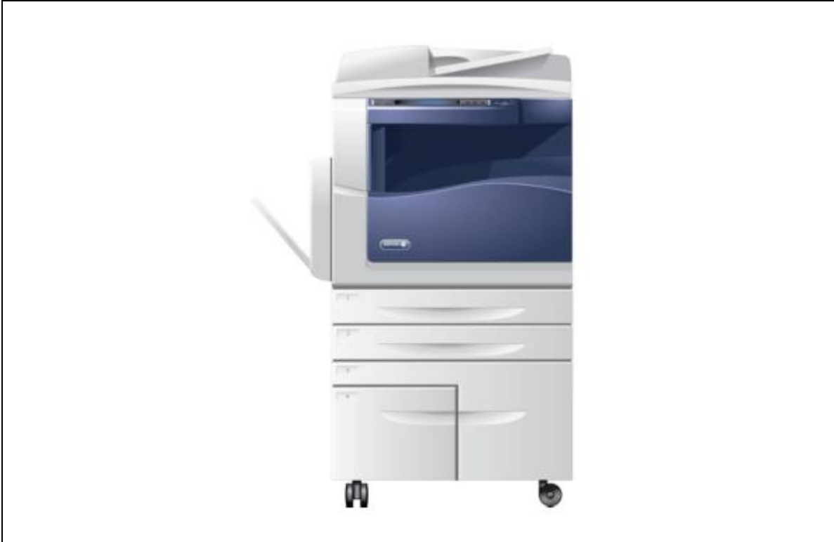
Figure 1: Xerox® WorkCentre® 5945/5945i/5955/5955i 2016 Xerox® ConnectKey® Technology

The TOE can integrate with an IPv4 network with native support for DHCP. The hardware included in the TOE is shown in the figure below.