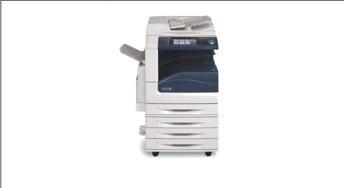
Figure 1: Xerox® WorkCentre® 7970/7970i 2016 Xerox® ConnectKey® Technology

The TOE can integrate with an IPv4 network with native support for DHCP. The hardware included in the TOE is shown in the figure below.