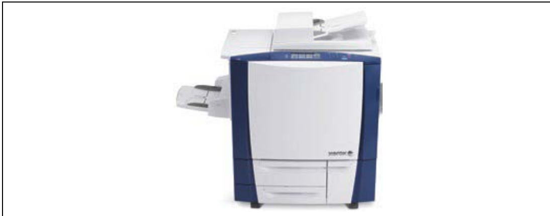
Figure 1: ColorQube® 9301/9302/9303 ConnectKey 1.5 Technology with FIPS 140-2 Compliance over SNMPv3

The TOE can integrate with an IPv4 network with native support for DHCP. The hardware included in the TOE is shown in the following figures.