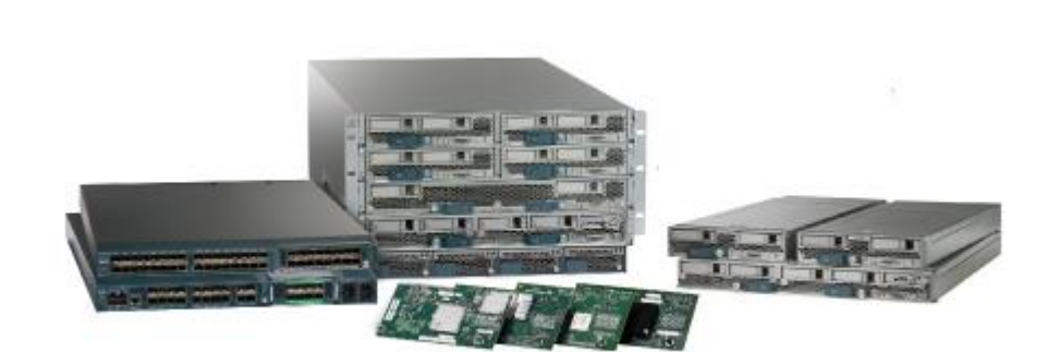
Figure 4: UCS and ENCS Hardware

The underlying UCS, ENCS and other general-purpose computing platforms running Intel Xeon E (Coffee Lake) and Intel Xeon D (Broadwell) processors that comprise the TOE have common hardware characteristics. These differing characteristics affect only non-TSF relevant functionality (such as throughput, processing speed, number and type of network connections supported, number of concurrent connections supported, and amount of storage) and therefore support security equivalency of the FTDv in terms of hardware.