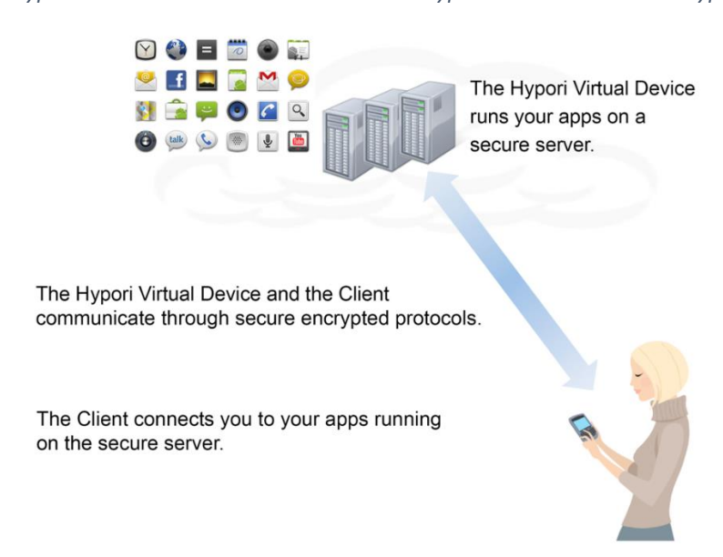
Figure 1 Hypori Halo Client Communication with a Hypori Virtual Device on a Hypori Server

The TOE comprises the Hypori Halo Client (iOS) 4.3 application that installs on the end user's mobile device and communicates with the Hypori Virtual Device on the server using TLS 1.2 (provided by the underlying iOS platform). The Hypori Server, Hypori Virtual Device, User Management Console, Admin Console, applications running on the Hypori Server, the hardware platform device, and any functions not specified in the ST are outside the scope of the TOE. Figure 2 shows the relationship of the TOE to its operational environment.