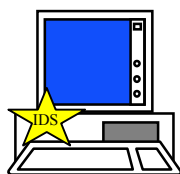
Figure-1. Computer System

A Scanner is a component of an IDS. Any IT System that needs to be aware of vulnerabilities and cyber attacks should deploy an IDS with one or more Scanner. The Scanner monitors itself as well as its target IT System. The IT System must provide adequate protection for the Scanner so that the Scanner operates in a non-hostile environment. The following diagrams illustrate examples of how an IDS (represented by a star) may be utilised by IT Systems ranging from a computer system to a computer network. Figure-1 illustrates that an IDS may monitor and exist in a computer system that is not necessarily part of a larger network. Figure-2 illustrates that an IDS may monitor and exist within a computer network. The arrows represent the monitoring functionality of the IDS as opposed to the implementation of the computer network.