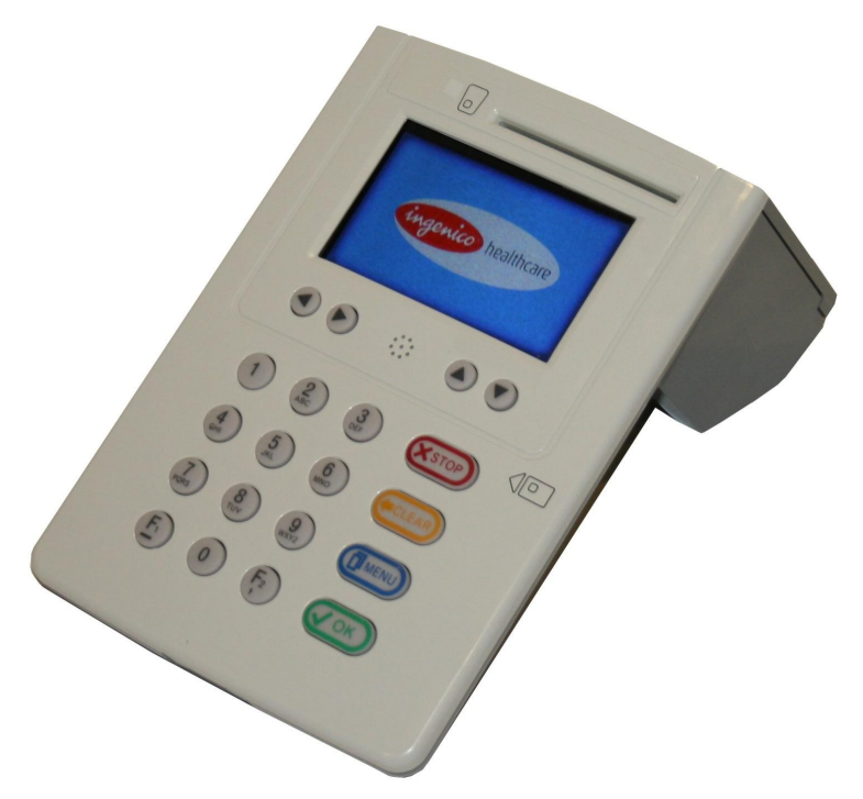
Figure 1.1 ORGA 6141

The Target of Evaluation (TOE) described in this Security Target is a smart card terminal which fulfils the requirements to be used with the German electronic Health Card (eHC) and the German Health Professional Card (HPC) based on the regulations of the German healthcare system. Please refer to [7] for further information about card compatibility.