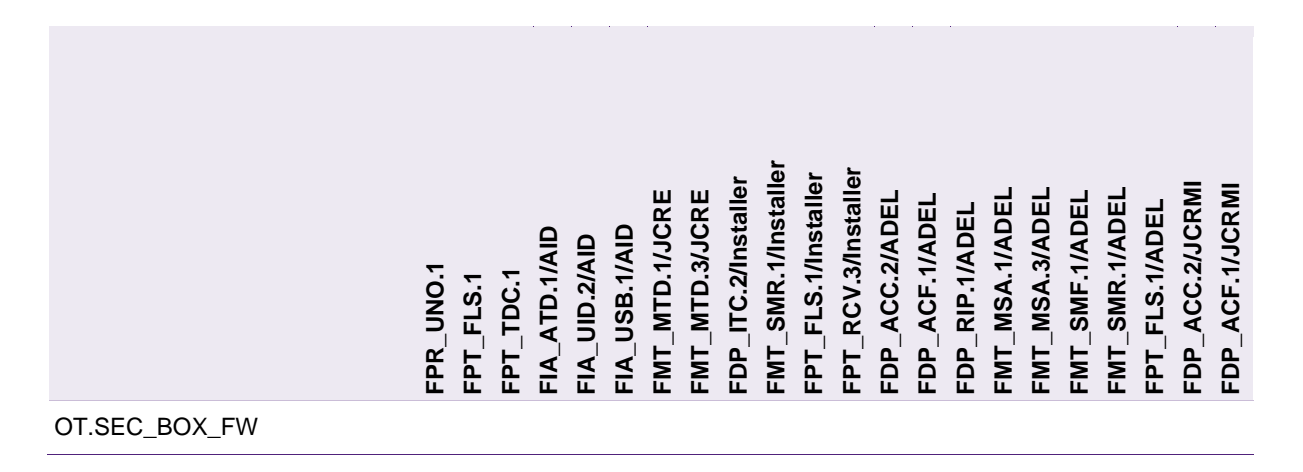
Table 27. Assignment: Security Objectives for the TOE - Security Requirements 3.