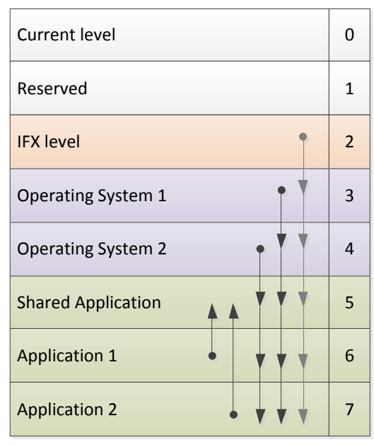
Table 17 Privilege levels of the TOE

The TOE shall meet the requirement "Subset access control (FDP_ACC.1)" as specified below.