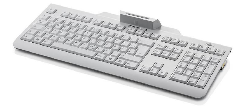
Figure 1: KB100 SCR eSIG

Theobroma Systems Design and Consulting GmbH designed the firmware for the S26381-K101-Lx xx-*-1 HOS:01 smartcard keyboard. The driver software is created by HID Global. Cherry GmbH is the manufacturer, Fujitsu is the product owner and distributor of the TOE.