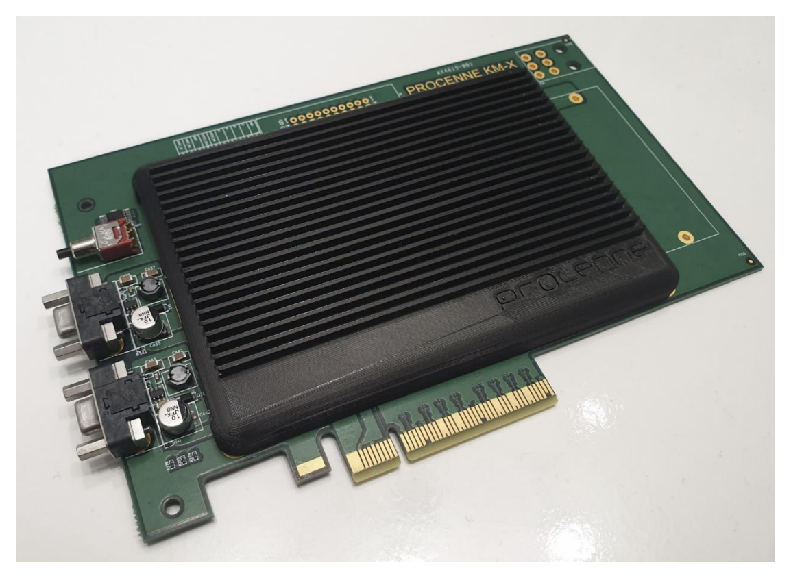
Figure 1: ProCrypt KM-X Module

The TOE is in system on module (SOM) form with a card edge connection and tamper resistive mesh layers on top and bottom. The gap between the electronic components and tamper resistant layers are filled with hard, opaque potting material (epoxy resin). Whole circuit area of the TOE, except the card edge connection, is the physical TOE boundary.