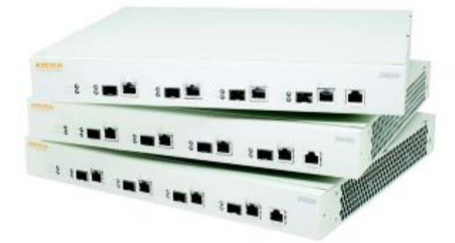
Figure 4: Aruba 3000 Series Mobility Controllers