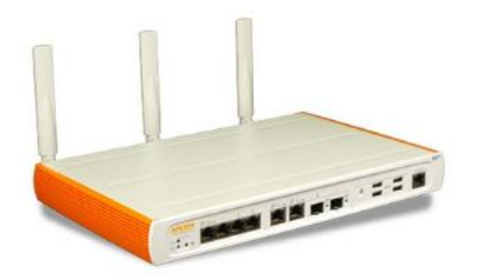
Figure 5: Aruba 600 Series Mobility Controller