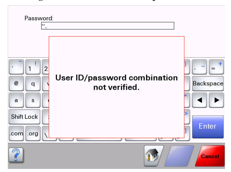
Figure 2. Three Failed Attempts Notification.

After three successive failed attempts at authentication, the touch screen user is notified with the GUI represented in the following figure. The system does not lock out the touch screen user account.