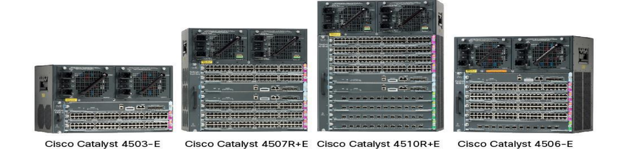
Table 5 Cisco Catalyst 4503-E, 4506-E, 4507R+E, 4510R+E Hardware Models and Specifications