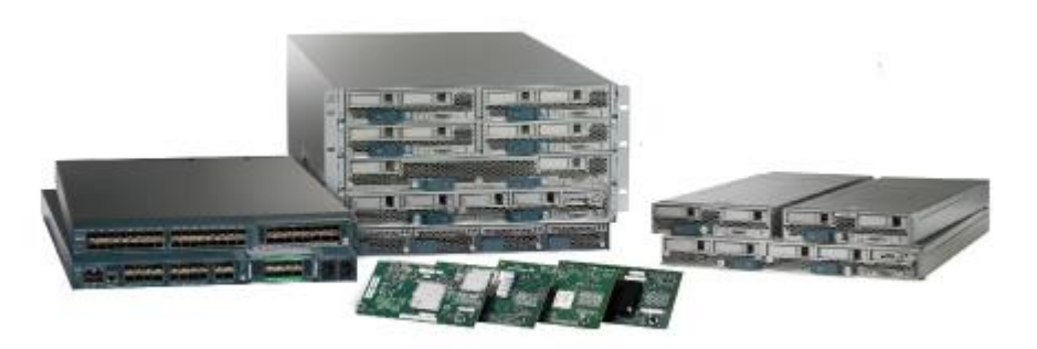
Figure 2: UCS Hardware

The UCS hardware components in the TOE have the following distinct characteristics: