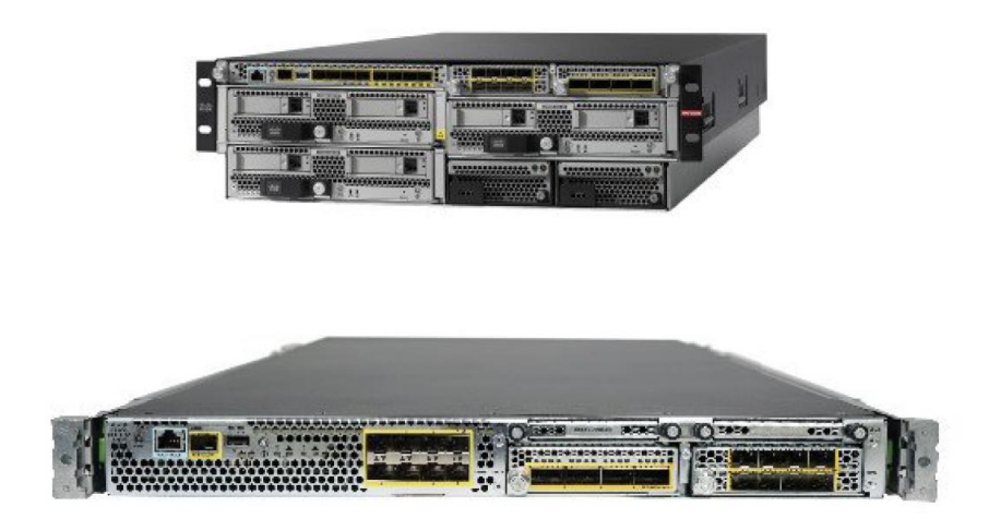
Figure 1: FP 9300 (first) and FP 4100 (second)

The hardware components in the TOE have the following distinct characteristics: