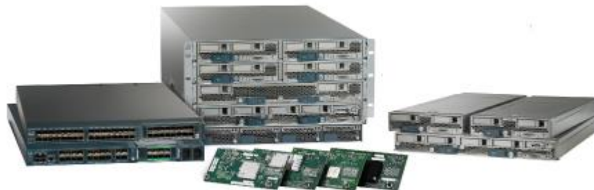
Figure 4: UCS and ENCS Hardware

The underlying UCS, ENCS and other general-purpose computing platforms running Intel Xeon E (Coffee Lake) and Intel Xeon D (Broadwell) processors that comprise the TOE have common hardware characteristics. These differing characteristics affect only non-TSF relevant functionality (such as throughput, processing speed, number and type of network connections supported, number of concurrent connections supported, and amount of storage) and therefore support security equivalency of the ASAv in terms of hardware.