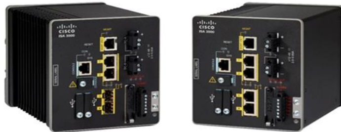
Table 5: ISA 3000 models