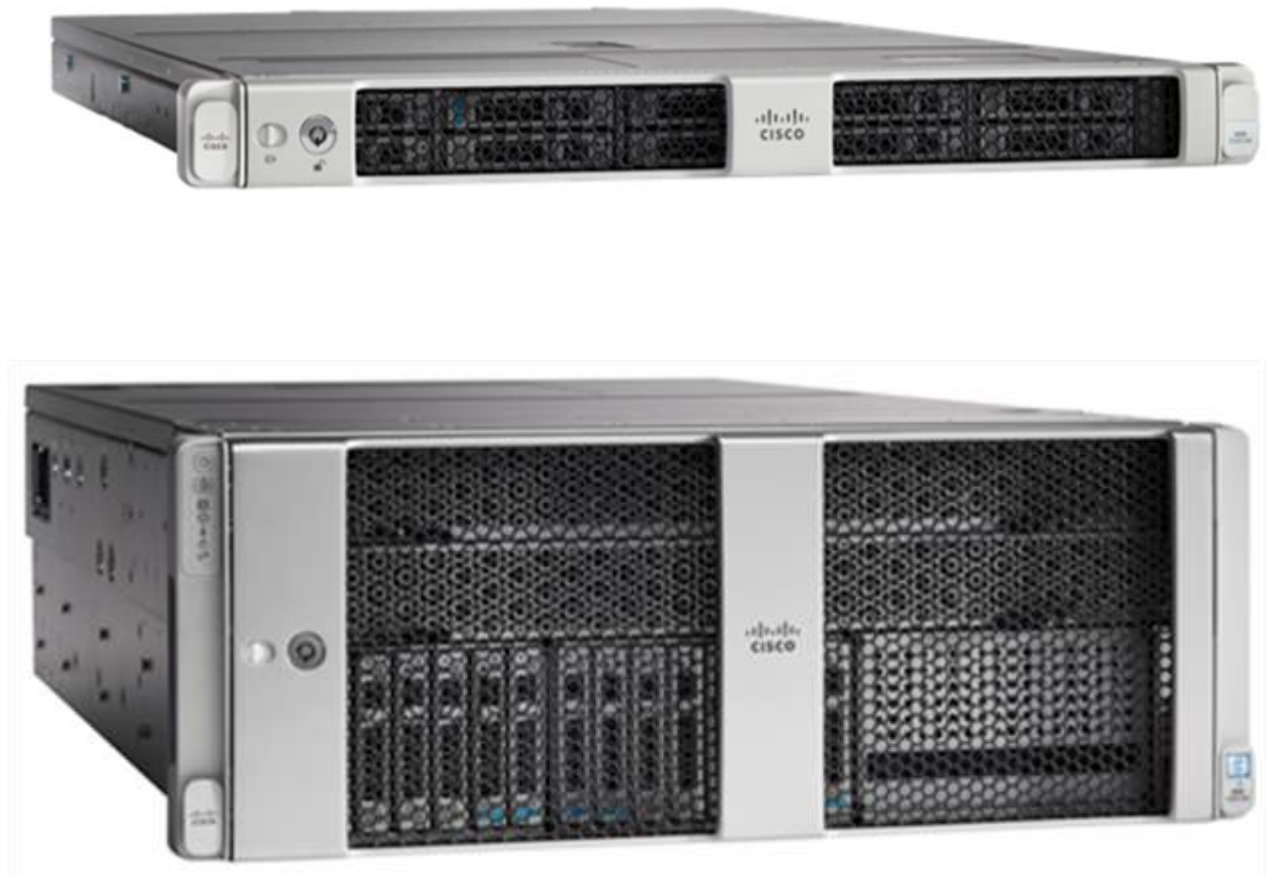
Figure 1: UCS Hardware

The underlying UCS platforms, that are a part of the TOE, have many common hardware characteristics. The only differing characteristics affect only non-TSF relevant functionality (such as throughput, processing speed, number and type of network connections supported, number of concurrent connections supported, and amount of storage) and therefore support security equivalency of the Cisco Secure Firewall Threat Defense Virtual Appliance in terms of hardware.